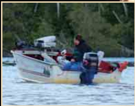
Flour Lake is noted for some great fishing and trophy smallmouth bass.