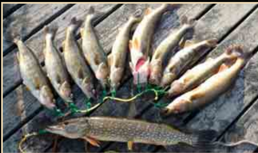
Fish for Smallmouth Bass, Walleye, Lake Trout and Northern.